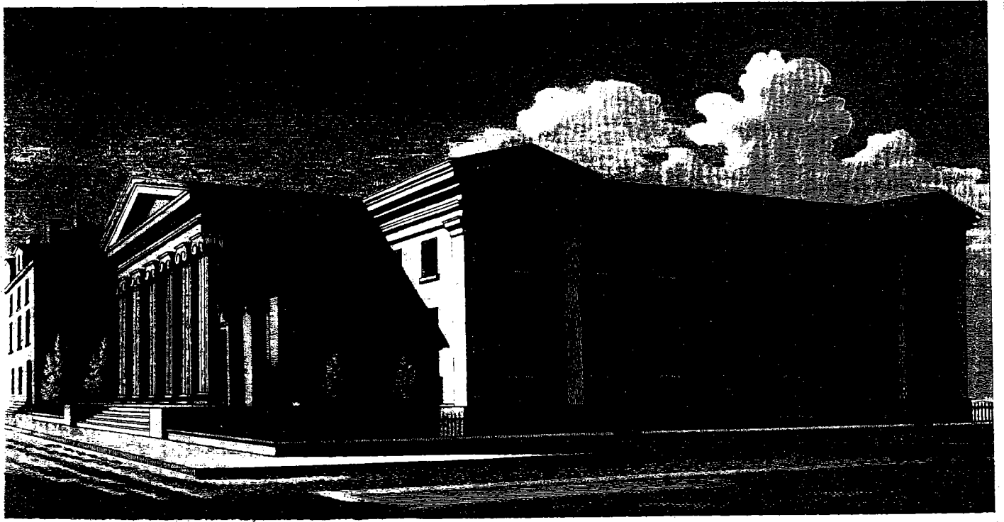
Designed & Drawn by W m Strickland Architect.